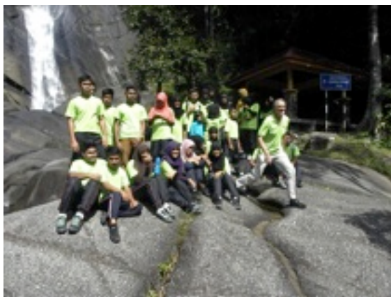
Group photo at the Seven Wells Waterfall where the students enjoyed the scenery and where they also learned about rock formation, flora and fauna.