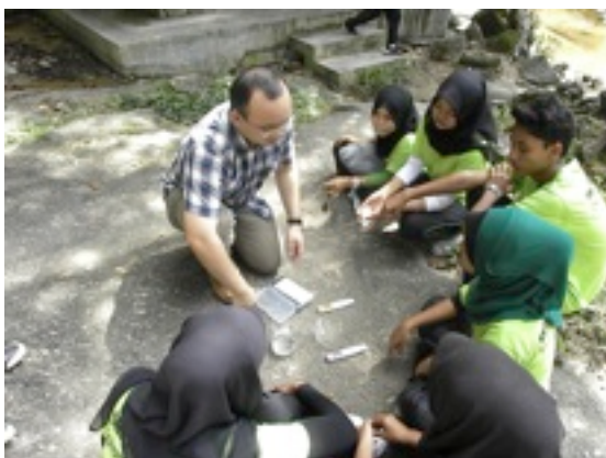
Dr Goh showing students how to test the pH of water.